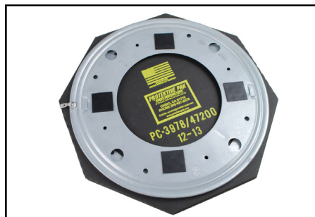
Galvanized Steel Turntable