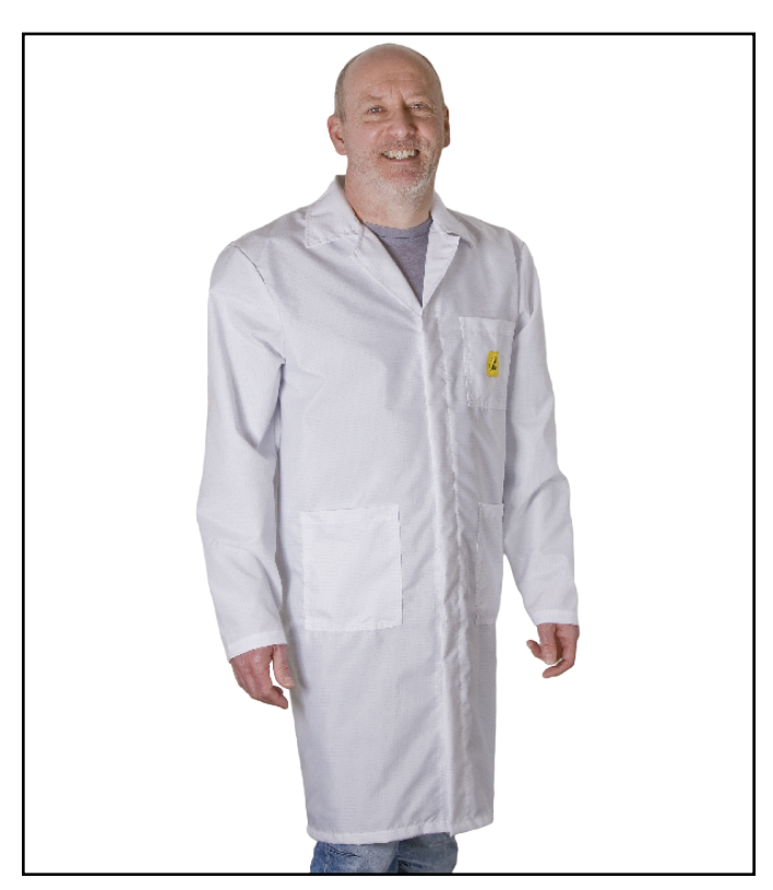
Figure 1. Desco Europe Static Dissipative Lab Coat