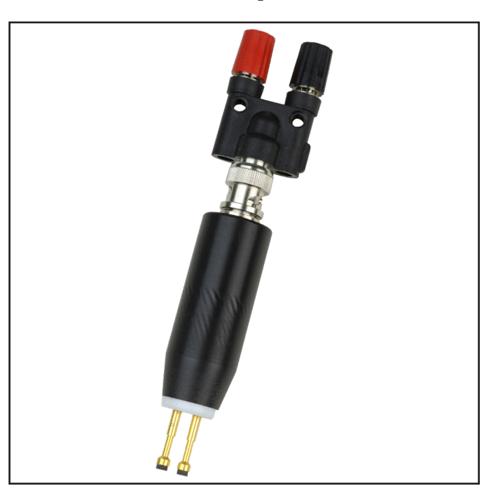
Figure 1. Desco 19297 Two-Point Resistance Probe