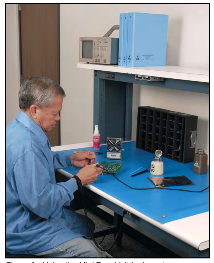
Figure 3. Using the Mini Zero Volt Ionizer at a workstation.

Connect the power adapter to the ionizer to turn it on. When the unit is first turned on, it conducts a self-test. The audible alarm will sound, and the status LED will cycle through orange and green. The LED will remain green during normal operation.