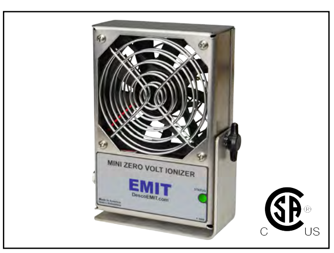
Figure 1. EMIT Mini Zero Volt Ionizer