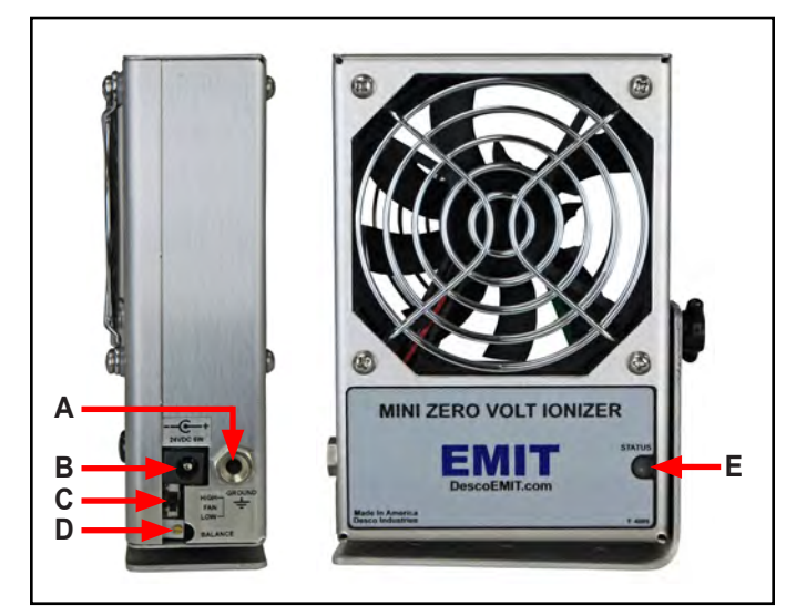
Figure 2. Mini Zero Volt Ionizer features and components