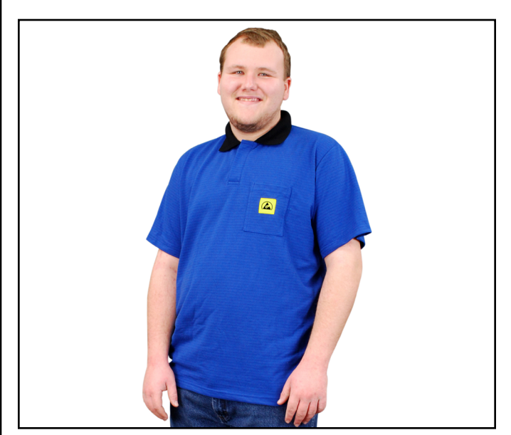
Figure 1. Desco Europe ESD Polo Shirt